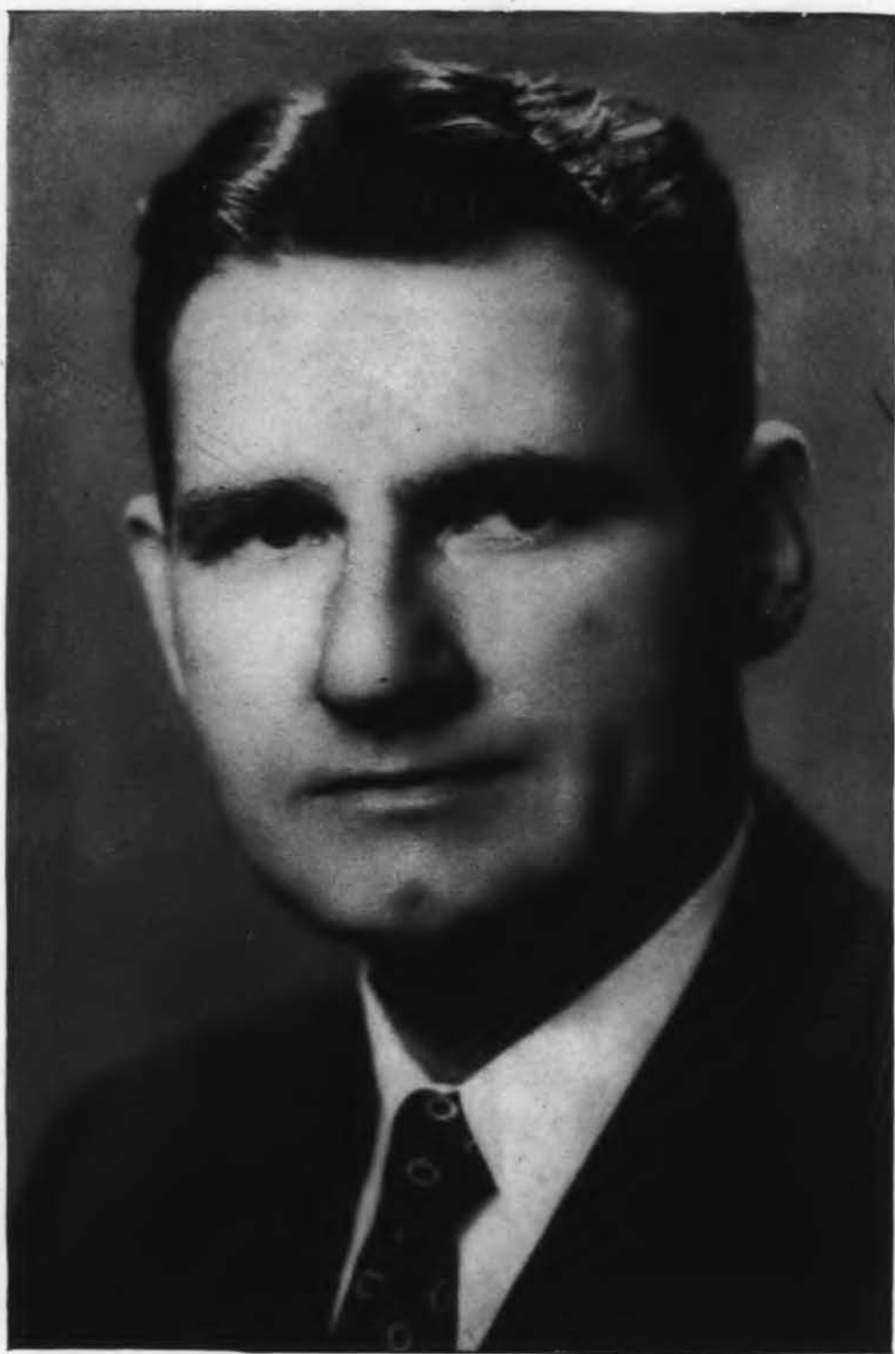
GOVERNOR MILLARD F. CALDWELL