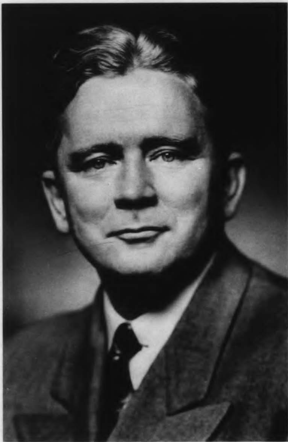
GOVERNOR FULLER WARREN