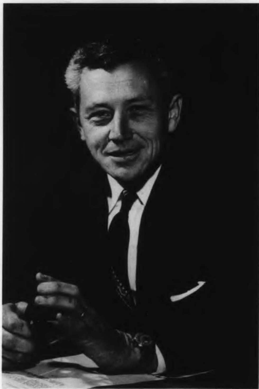
GOVERNOR LEROY COLLINS