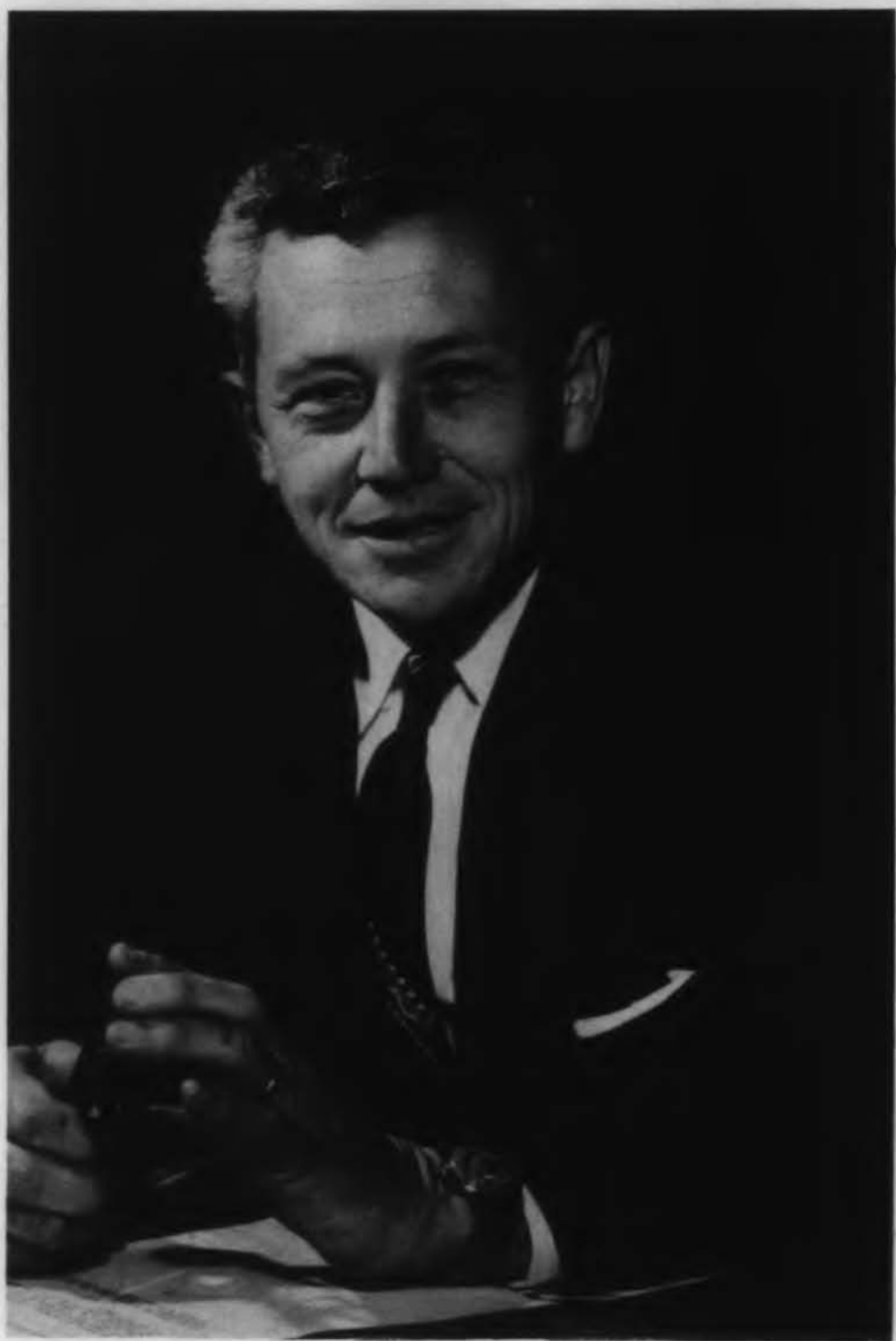
GOVERNOR LEROY COLLINS