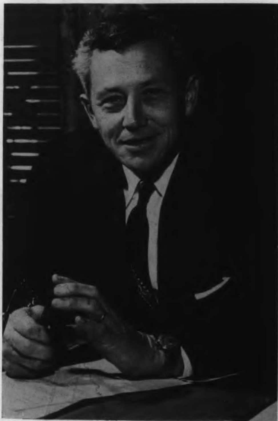
GOVERNOR LEROY COLLINS