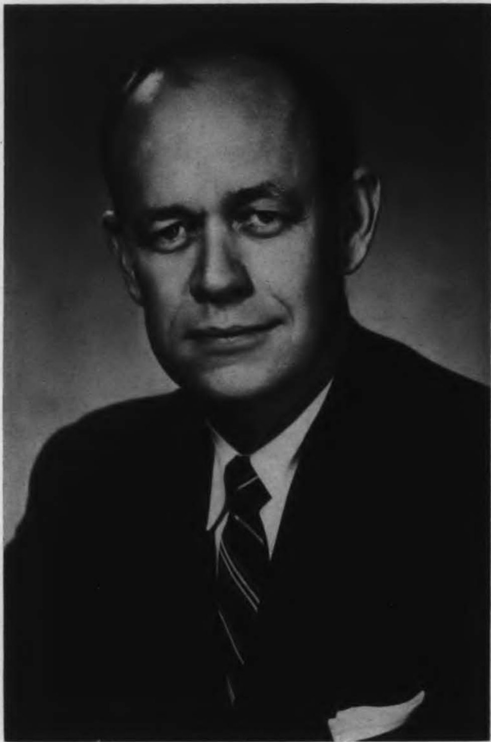
GOVERNOR FARRIS BRYANT