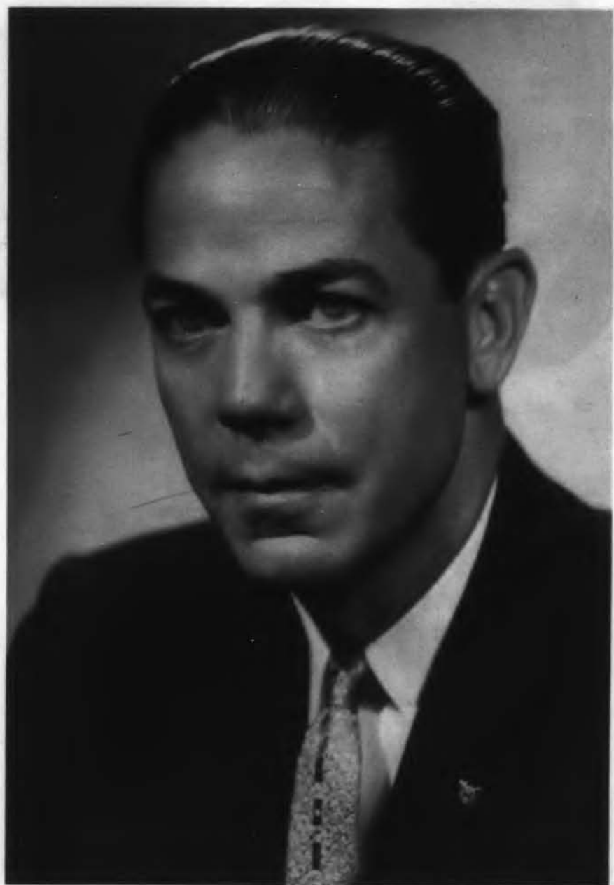
GOVERNOR HAYDON BURNS