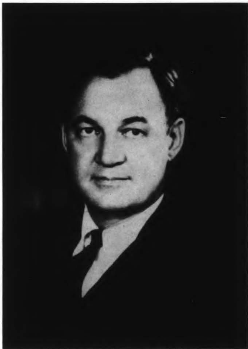
GOVERNOR CLAUDE R. KIRK