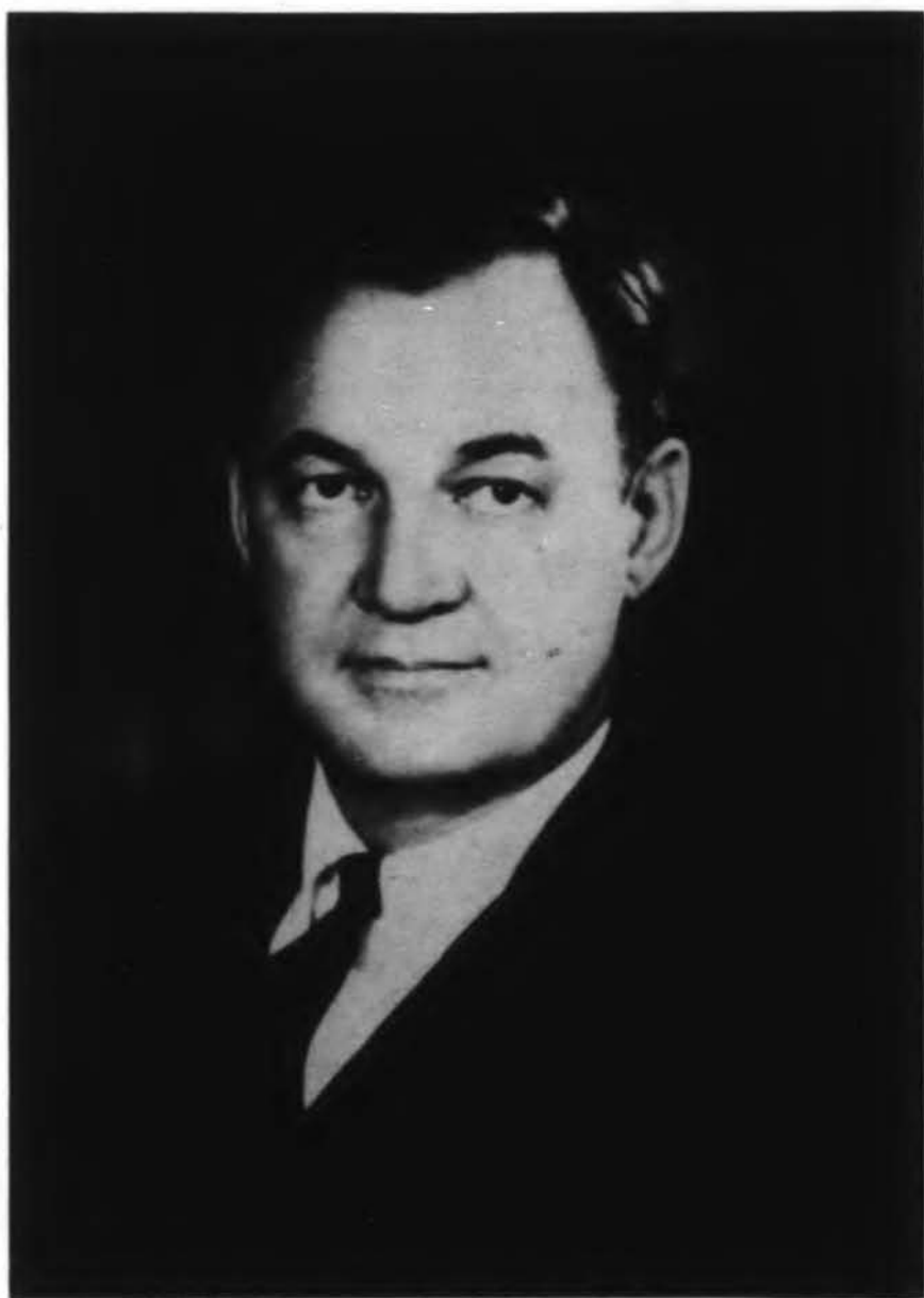
GOVERNOR CLAUDE R. KIRK