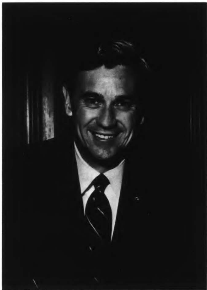
GOVERNOR REUBIN O'D. ASKEW