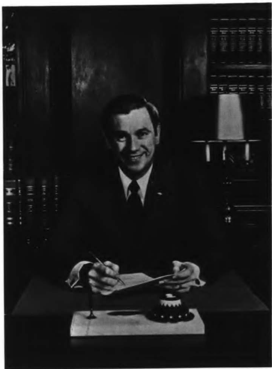
GOVERNOR REUBIN O'D. ASKEW