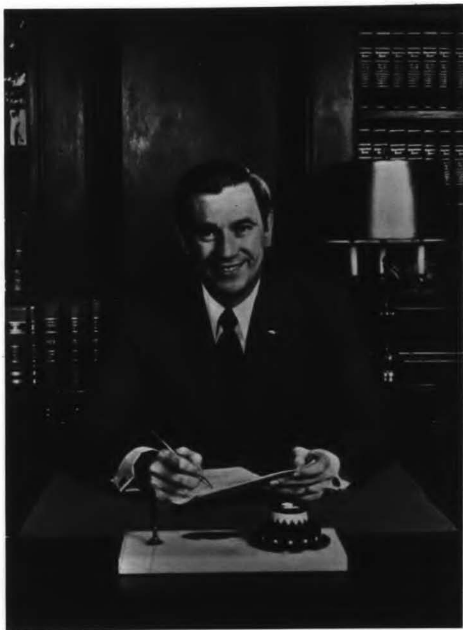
GOVERNOR REUBIN O'D. ASKEW